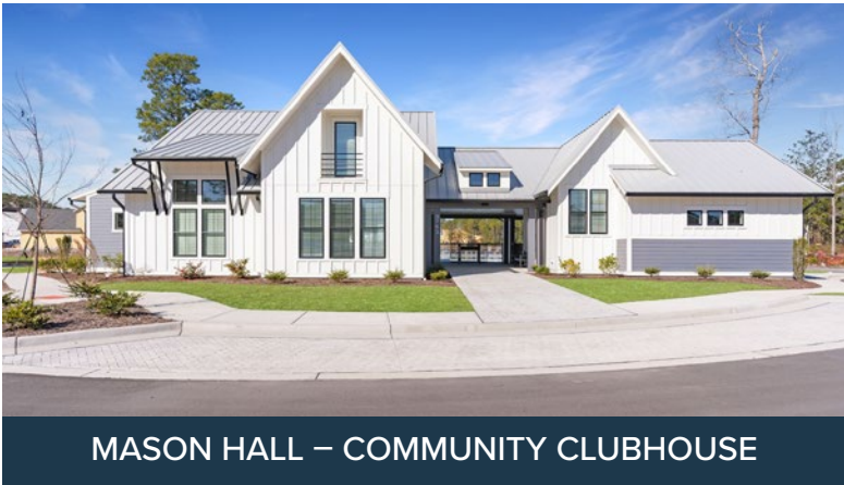
MASON HALL – COMMUNITY CLUBHOUSE

East & Mason is excited to deliver homes and amenities that offer work-from-home opportunities, integrate indoor and outdoor living, and accommodate multi-generational living. Our vision is to bring people together by creating a unique sense of place in a walkable coastal community. Mason Hall, our community clubhouse includes a large event room and warming kitchen, flexible meeting & activity rooms, and a six-lane swimming pool.