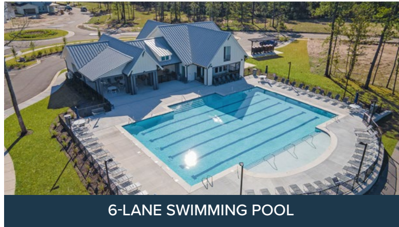
6-LANE SWIMMING POOL