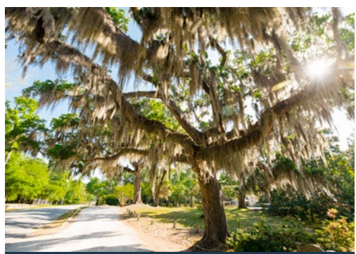
STEEPED IN HISTORY

East & Mason offers convenient access to top schools, shopping, natural amenities, and outdoor recreation.