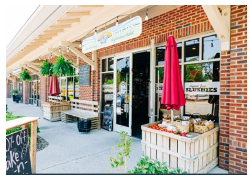
UNIQUE & LOCAL SHOPPING

Masonboro Elementary School is right across the street, soon to be linked to East & Mason by a new 1.4-mile pedestrian and bike path.